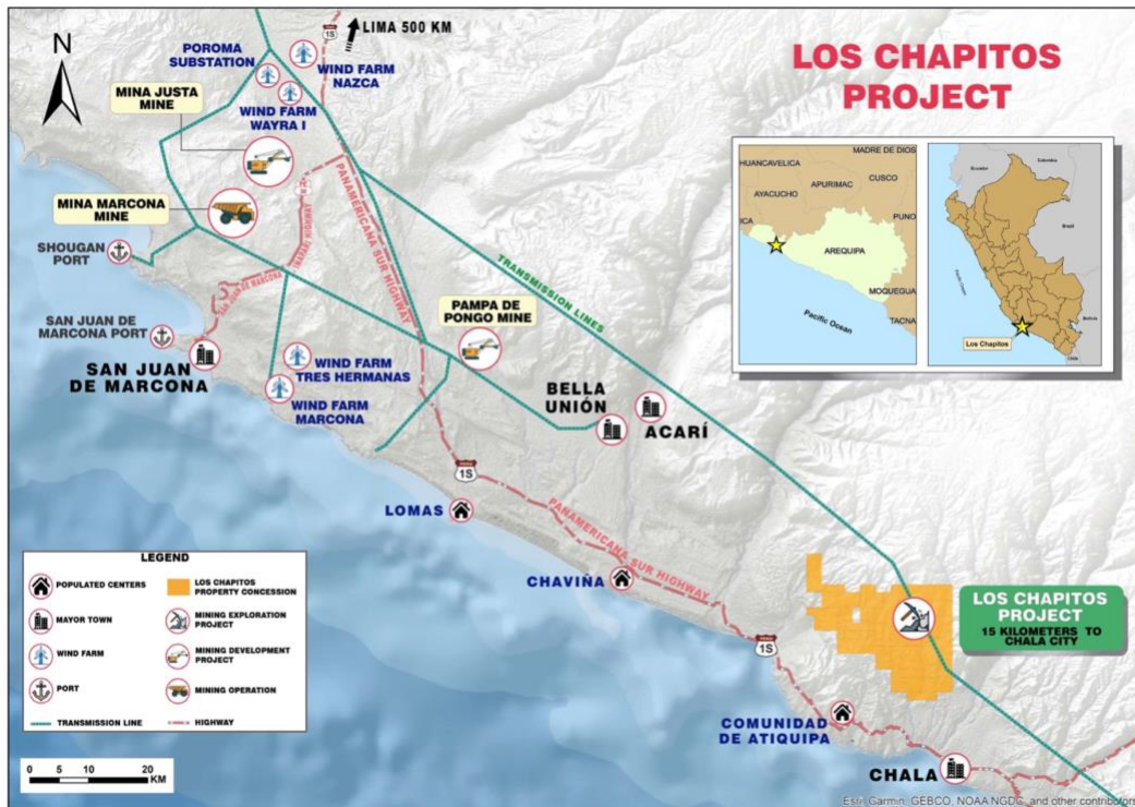
Figure 3. Location Map of the Los Chapitos Copper Project along the coastline of Peru